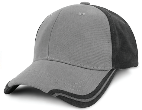
DARK GREY/DARK CHARCOAL